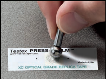
For use with OPTICAL Grade Testex™ Press-0-Film™ Replica Tape

Measures and records surface profile parameters using replica tape